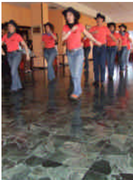
The ProAline of Sant Jordi (Mallorca)