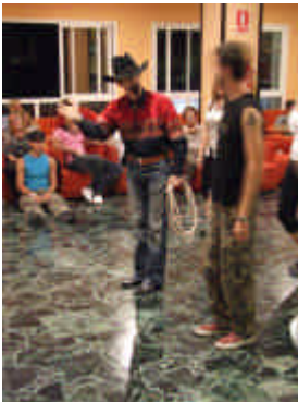
Chatti the Valley in action